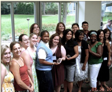
5th year Scholars honored in 2008