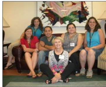
Golden Apple Teaching Scholars and Fellows