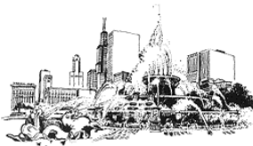
Clarence Buckingham Fountain, 1927 Grant Park/Lake Shore Drive