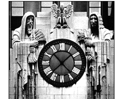
Map Location: S29

Chicago Board of Trade, 1930 141 W. Jackson Blvd. Art Deco Lobby; Statue of Ceres atop