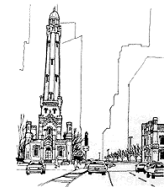
Map Location: N9