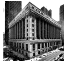
Map Location: S13

City-County Building, 1905-08 and 1909-11 121 N. LaSalle/118 N. Clark