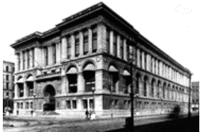
Chicago Cultural Center (Old Library), 1897 78 E. Washington St. Interior Decorations / Mosaic Ceilings