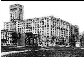
Auditorium, 1886-90 430 S. Michigan Avenue Interior (not typically open)