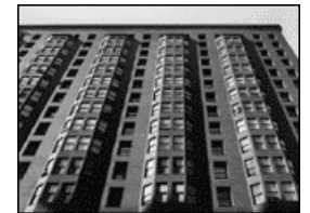
Map Location: S30

Monadnock Building (North 1889-91, South 1891-93) 53 W. Jackson Blvd. Impact of steel frame construction: 2 phases