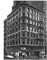
Map Location: S10

Delaware Building, 1872-74 36 W. Randolph St. Interior Iron Stairwell—starts on 2nd floor (This requires a bit of investigation to find!)