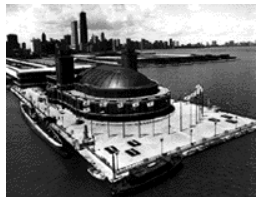
Navy Pier, 1916 (end masonry structures) 600 E. Grand Avenue