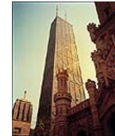
Map Location: N22