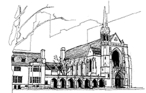
Map Location: North of N9