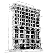
Map Location: S35

Fine Arts Building, 1885 and 1898 410 S. Michigan Avenue 10th floor murals Be NICE to the elevator operator.