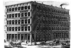
Map Location: S11

Page Brothers Building, 1872-74 177-91 N. State St. Cast iron façade on Lake St.